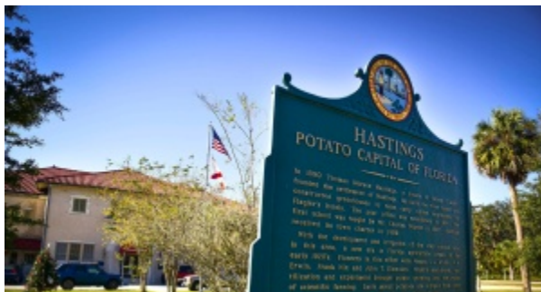
St. Johns County