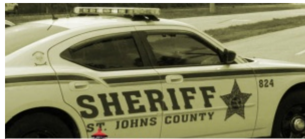
Sheriff's Office: Man arrested